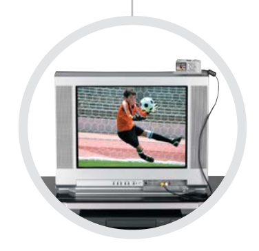
Hook directly to your TV show friends and family the results on a grand scale